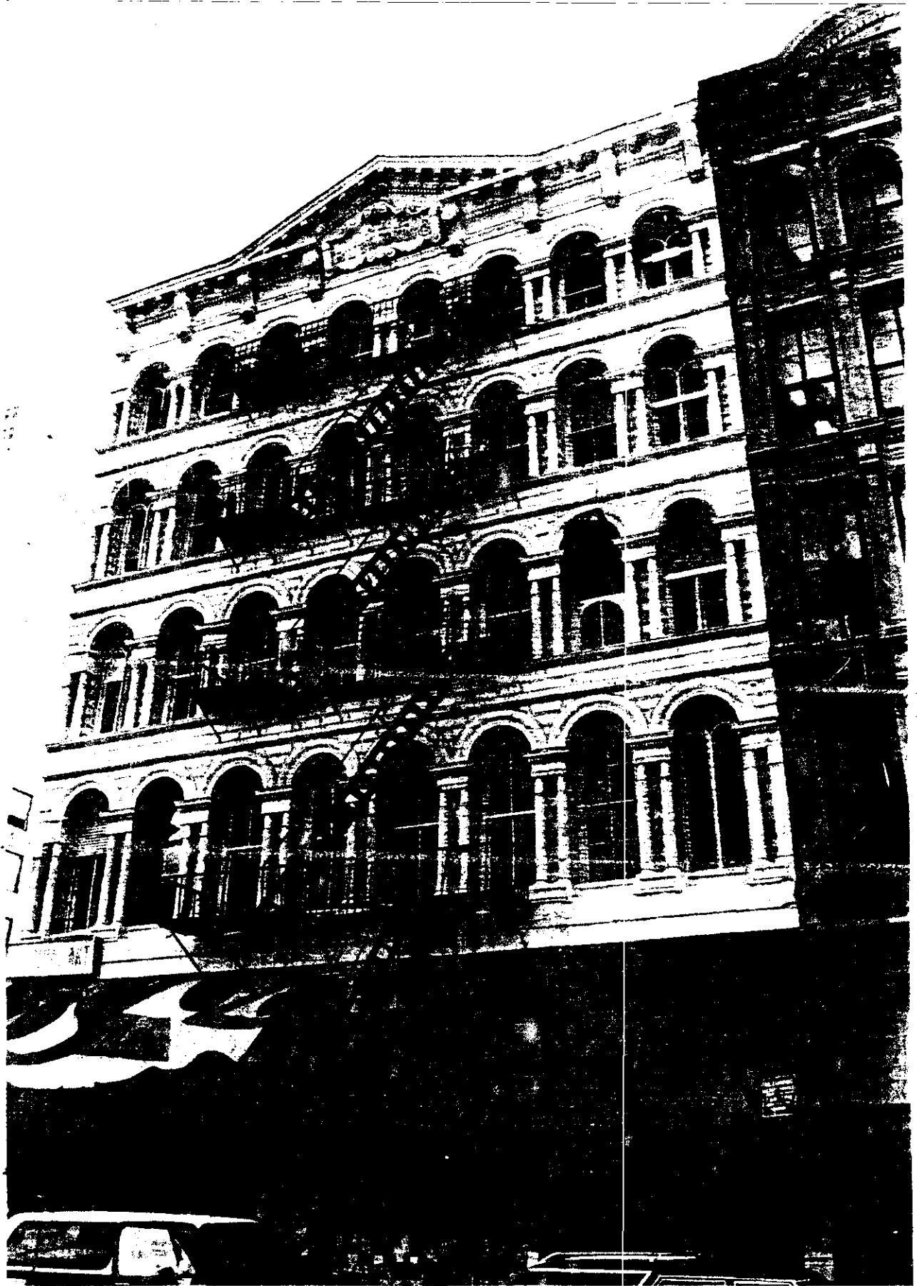
Cary Building 89-91 Reade Street Facade Manhattan