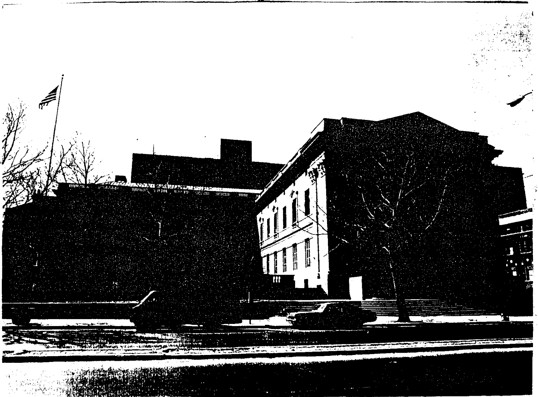
RICHMOND COUNTY COURTHOUSE (East Elevation and Garden) Built 1913-19