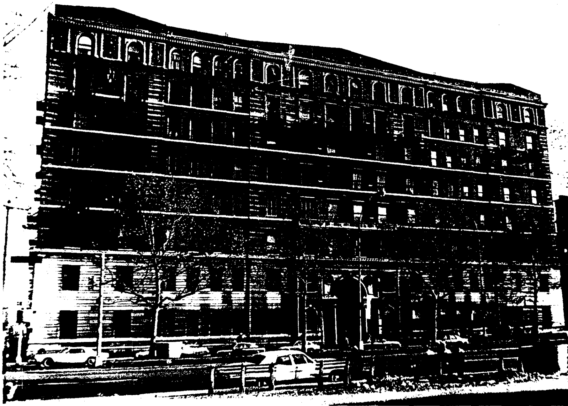
Graham Court Apartments, 1923-1937 Adam Clayton Powell, Jr., Blvd. Clinton & Russell, architects. Built: 1899-1901