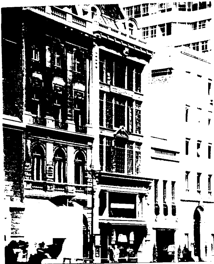
Rizzoli and former Coty Building 712 and 714 Fifth Avenue