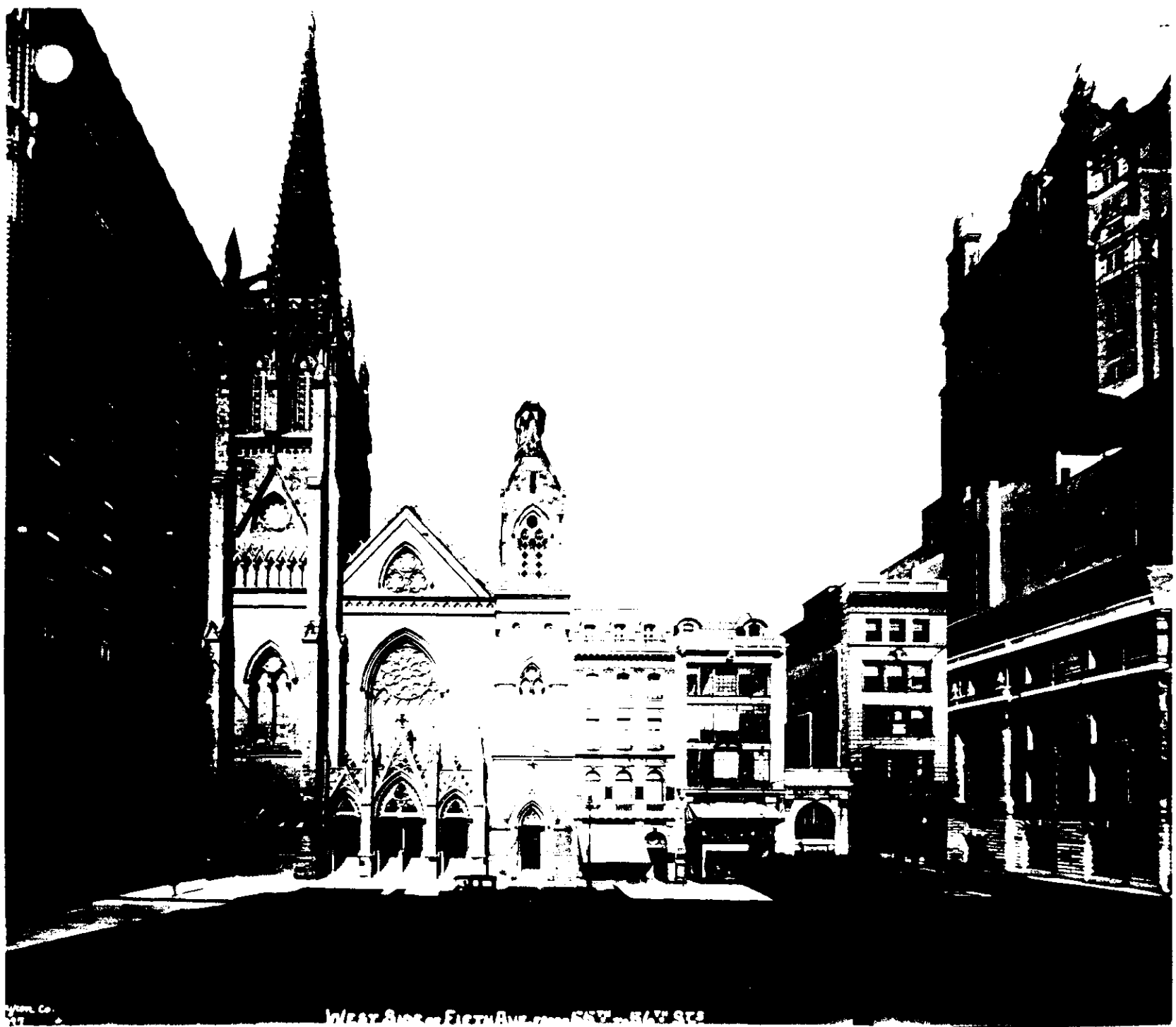
West side of Fifth Avenue between 55th and 56th Streets 1924 photograph