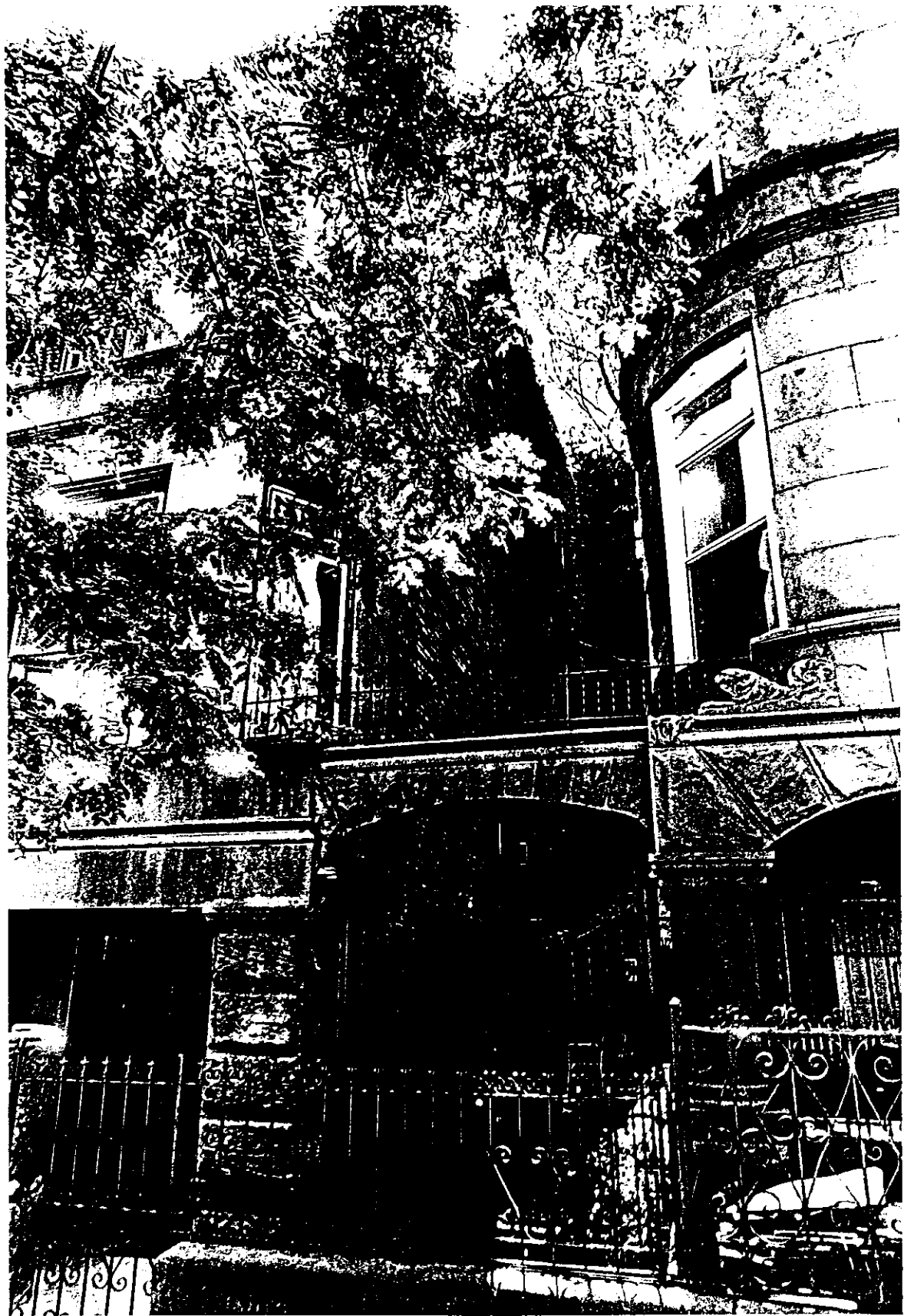
254 West 102nd Street House, Manhattan. West facade. 1892-93; Schneider & Herter, architects.