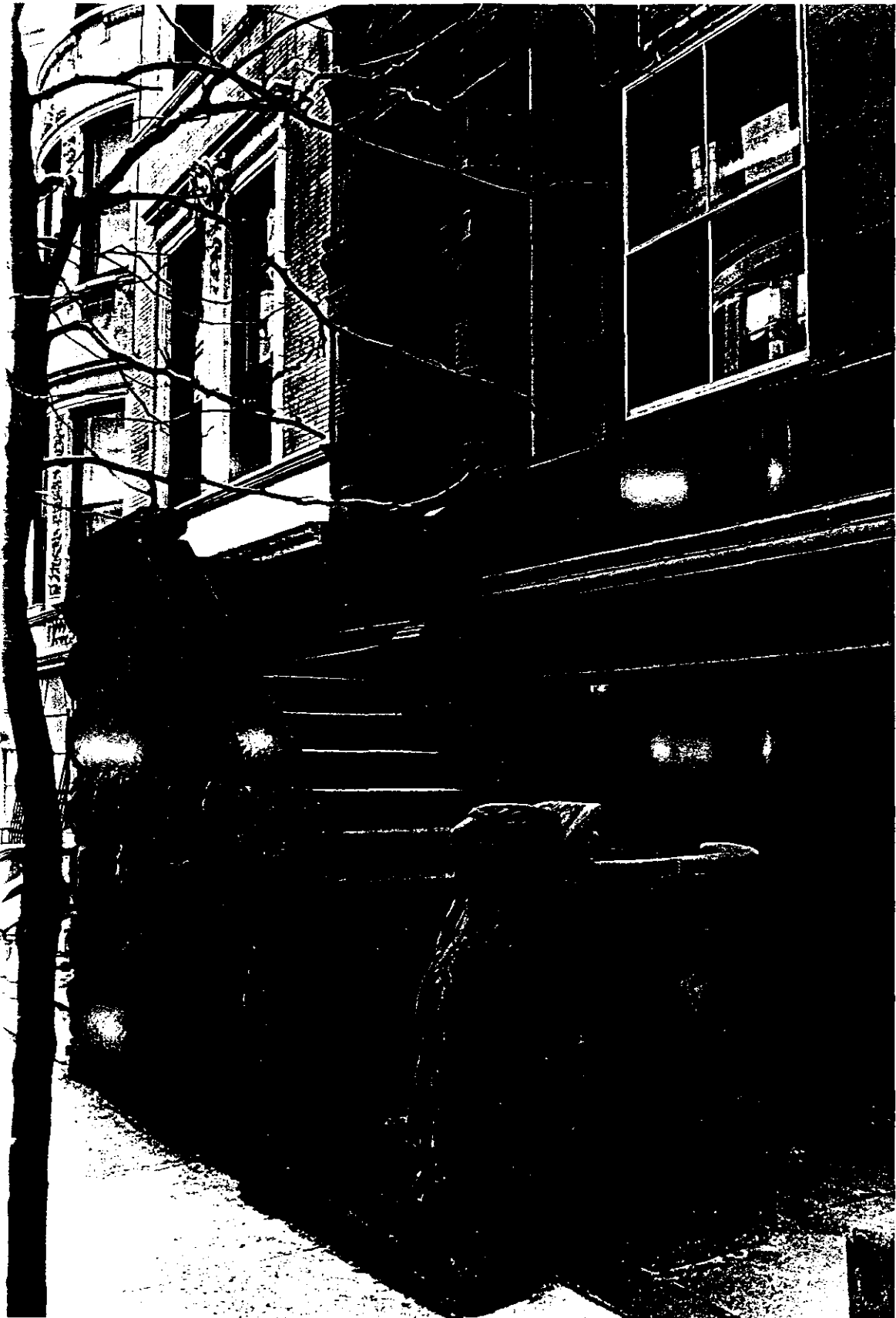
254 West 102nd Street House, Manhattan. Detail, stoop. 1892-93; Schneider & Herter, architects.