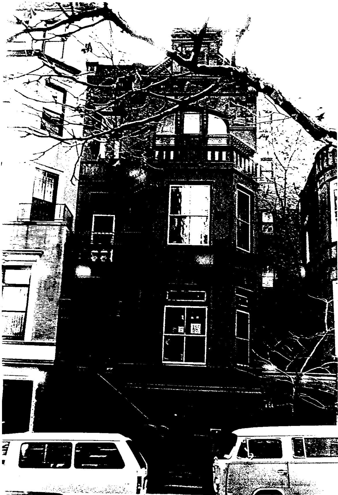
254 West 102nd Street House, Manhattan. 1892-93; Schneider & Herter, architects.