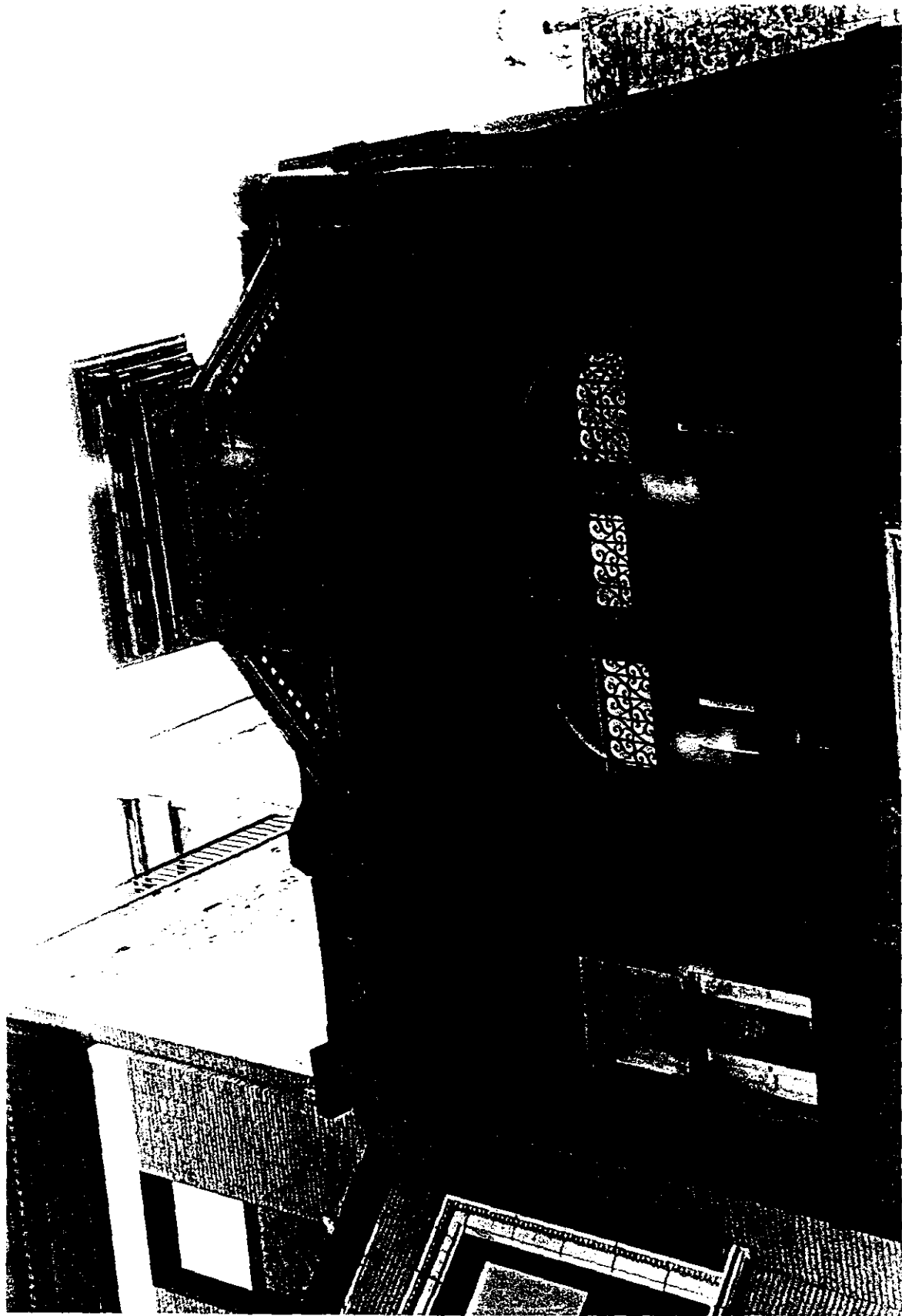
254 West 102nd Street House, Manhattan. Detail, upper story. 1892-93; Schneider & Herter, architects.