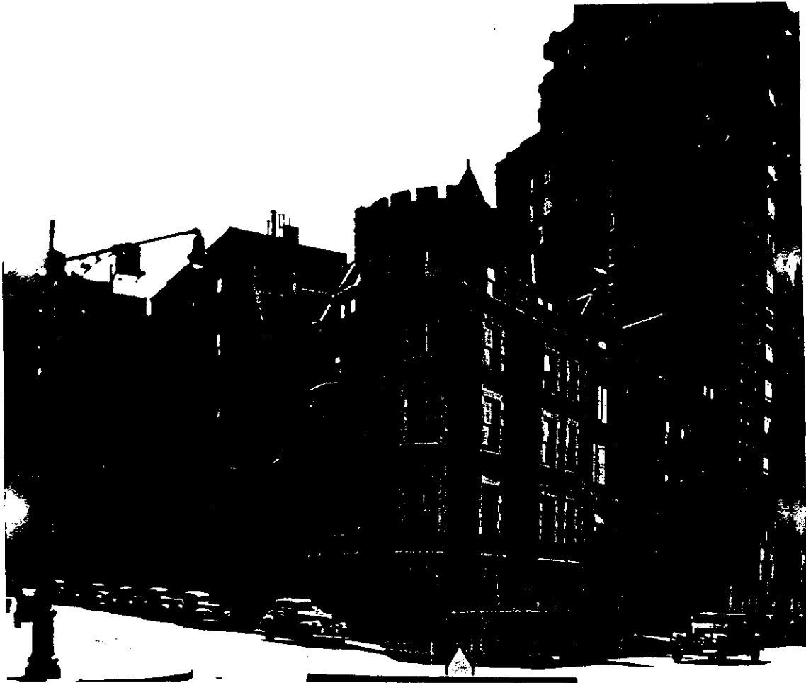
103-107 Riverside Drive and 332 West 83rd Street Houses Historical Photograph c. 1940 View of Facades