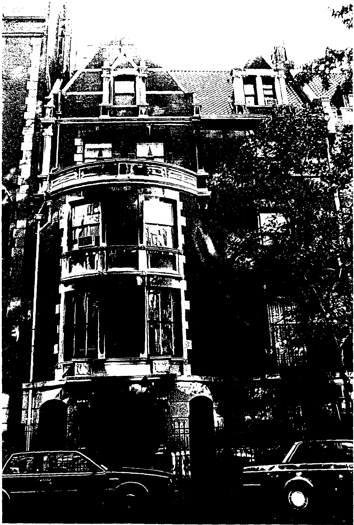
332 West 83rd Street House Architect: Clarence True Built: 1898-99