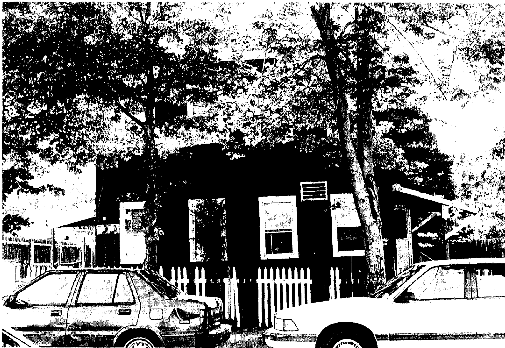
Kreischerville Workers' Houses, 81-83 Kreischer Street, Charleston, Staten Island.