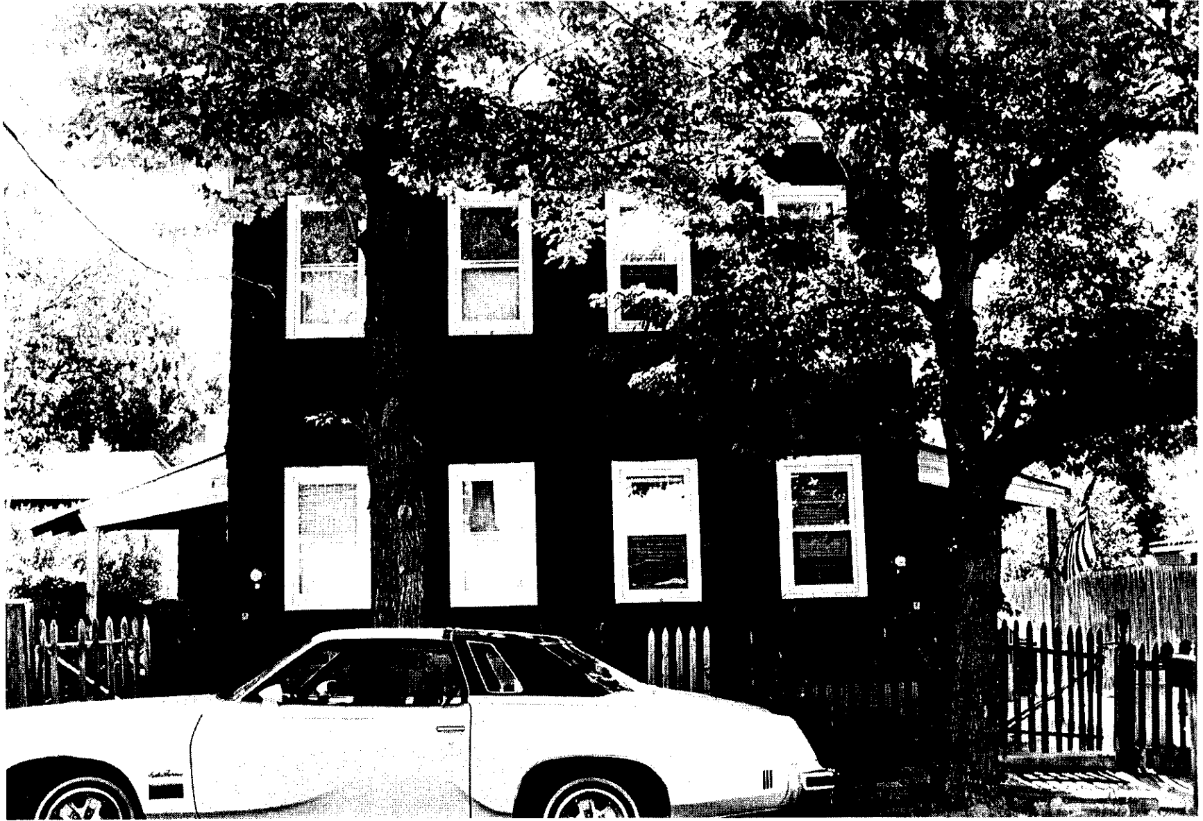
Kreischerville Workers' Houses, 85-87 Kreischer Street, Charleston, Staten Island.