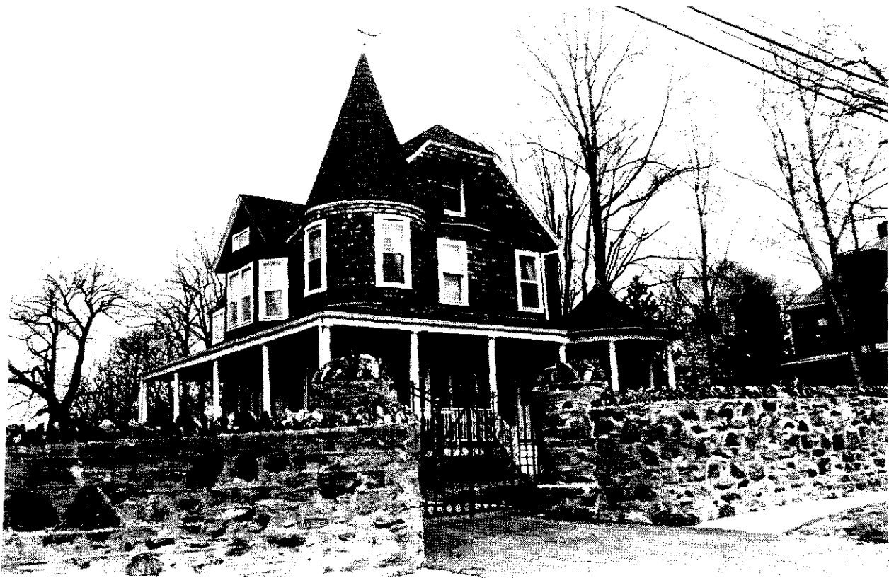
West and South Elevations