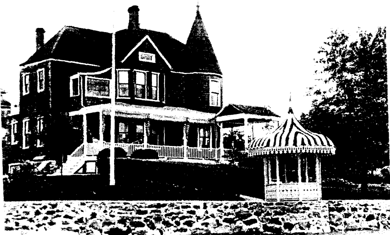
Delmours Point, City Island, N.Y., aka 21 Tier Street House, circa 1905-1910