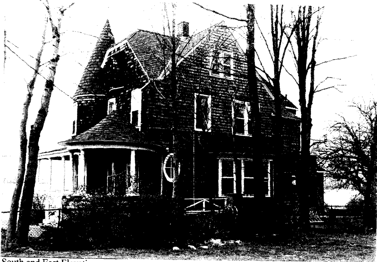
South and East Elevations