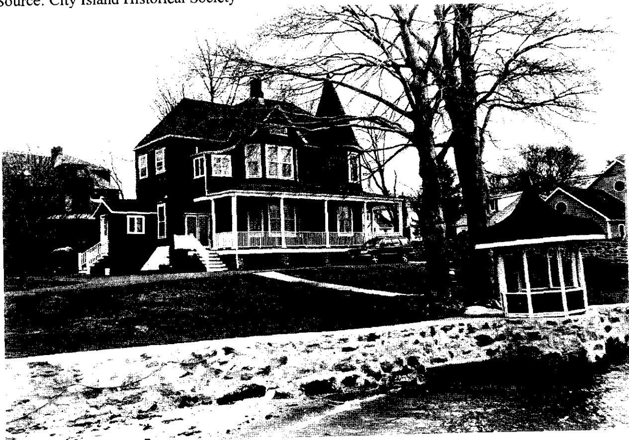
North and West Elevations