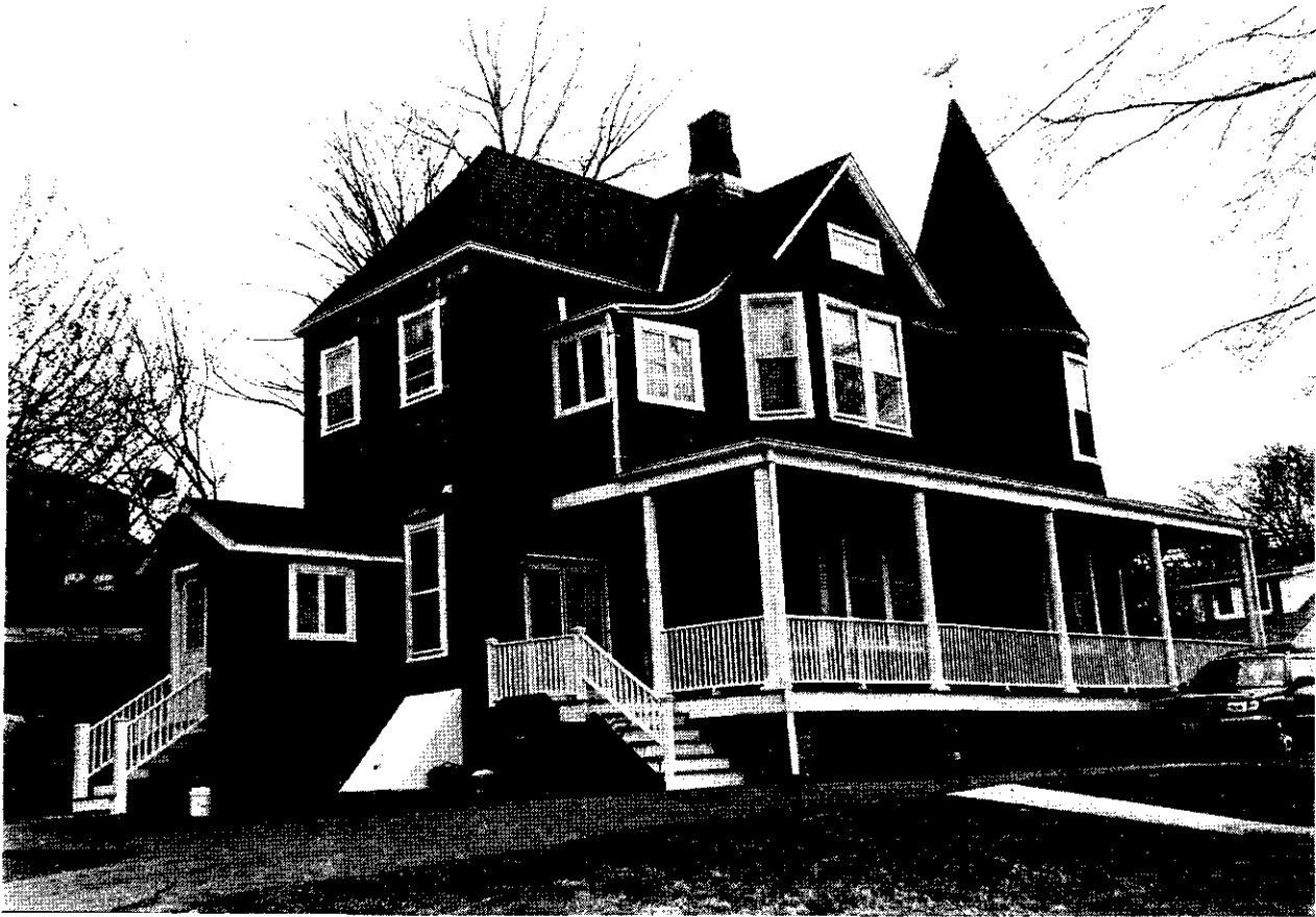
North and West Elevations