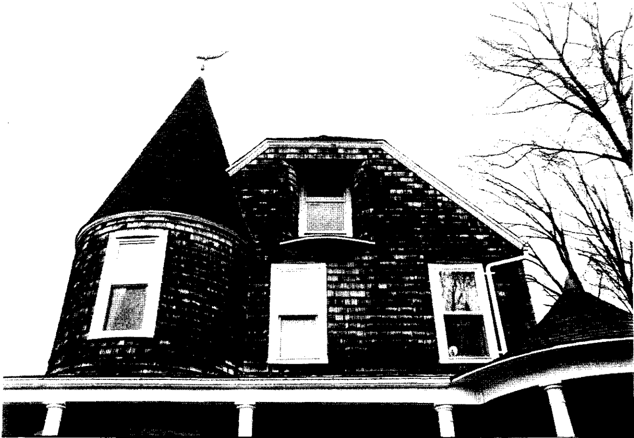
Detail of South Elevation