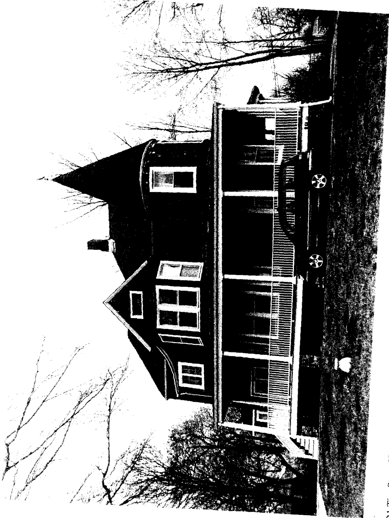
21 Tier Street House, The Bronx West elevation